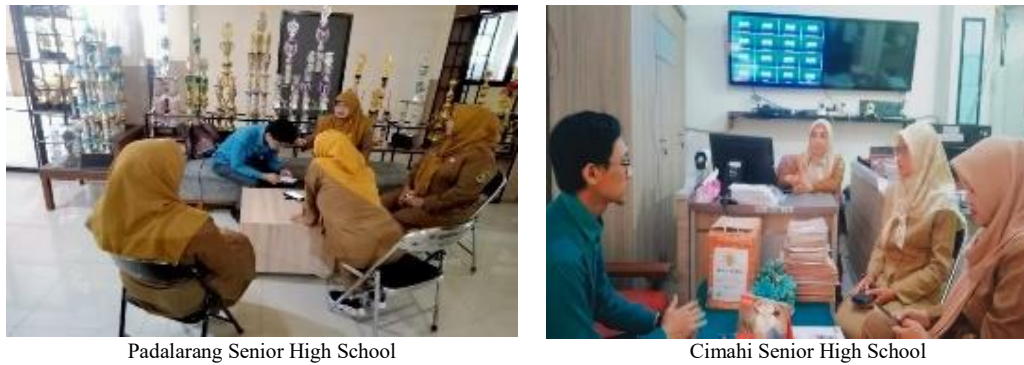
Figure 1. Directions to Indonesian Language Teachers

The primary field trials were conducted at Cimahi Senior High School, Padalarang Senior High School and Ngamprah Senior High School from February 1 st to February 16 th , 2024. The field trial activities were adjusted to the schedules of the Indonesian language teachers at each school. The following presents documentation of the implementation of the writing skills assessment model during the primary field trials in the experimental classes Cimahi Senior High School and Padalarang Senior High School and the control class Ngamprah Senior High School.