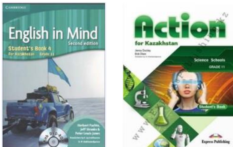
Figure 1. English Language Textbooks Used for Grade 11 in Kazakhstan

The study reveals the differential characteristics of the textbooks regarding content, pedagogical approach, and alignment with curriculum standards. It provides insights into how each manual supports the targeted learning outcomes and competencies within the context of Kazakhstan’s educational objectives (Table 2).