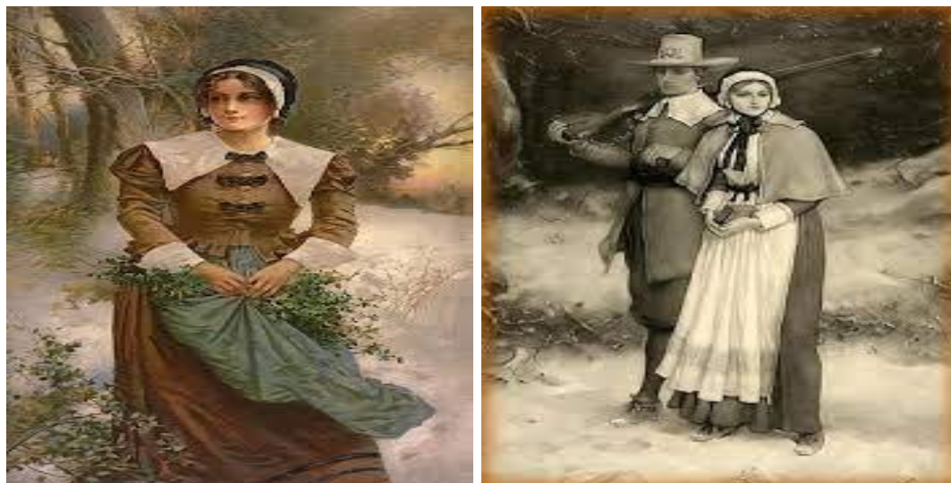
Figure 2. Portrait of Puritan Women in the Northern American Colony, Massachusetts and a Young Family Pair in 18 th Century Plymouth

The discussion on notion of traditional American women is rather complex because of the various backgrounds of religion, culture, traditions, teachings, models, and social classes inherited from Europe, as has been explained regarding the historical aspects of the arrival of European women in the American colonies. They come from various ethnic groups, and nations. Researchers in this part generalize notions of traditional American women which are considered to reflect various types of traditional women as housewives who also prepare their daughters to marry and teach them to manage the household well.