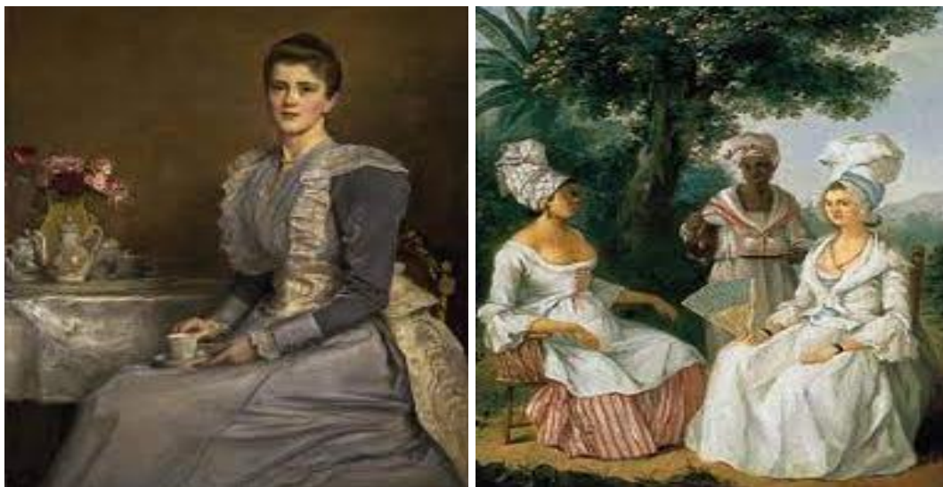
Figure 1. Portrait of a Traditional Elite Woman in the Southern American Colony, Virginia, Who Maintained the European Ideal of Women as Housewives, Arranging Home Accessories, and Managing Slaves

According to Yeni's (2021) view, traditional women have a natural relationship with men in terms of roles and positions. The role of women is positioned as producers in the life system, while men act as exploiters. For example, in the reproductive function, women give birth as a result of the exploitation of men. It causes sexual exploitation of women by men. Traditional society according to Sapiro (1986) generally adheres to patriarchal values so it is prone to injustice in the gender relations between men and women. Patriarchy is the basis for justifying male dominance over women in various aspects of life such as family, politics, economics, law, culture, and others. Gender justice can be achieved if patriarchy is transformed into equality by eliminating all forms of male superiority over women.